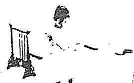
Anika, aged 11

If you think calligraphy is a difficult skill, see what our 2022 participants have to say: